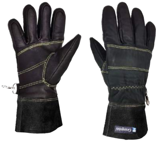
Cuff: B (Funnel)