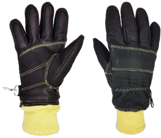
Cuff: D (Knitted aramid)